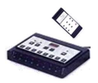
Fig. 2: "People Meter" Device for DTH type ROTs with Remote

The technology is already available and implemented for the TAM (Television Audience Measurement)/ TRP (Television Rating Point), which indicates the popularity of the channel/programme. This rating helps to decide the advertisement rates for various programmes/channel. In India INTAM (Indian Television Audience Measurement) and a few other agencies are providing services to evaluate the rating of the channel/programme.